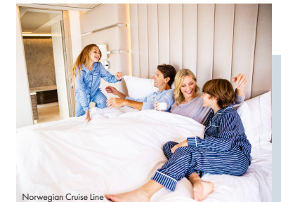
Norwegian Cruise Line

Terms & conditions: All prices are 'from' amounts per person based on number sharing specified for selected departure dates within the travel period shown. Package pricing includes pre-payable taxes, Airline Failure & ATOL protection cover, return economy flights (unless specified otherwise), transfers, cruise and accommodation as specified. All offers are subject to availability and are correct at time of publication, restrictions and book by dates may apply. All available discounts and savings are included in the price shown. For full booking terms & conditions please ask your travel agent for details. Holidays operated by Gold Medal Travel Group limited, ATOL protected 2916, ABTA V6805.