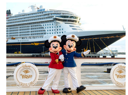
Disney Wish

Staying in an Interior Stateroom, upgrade to an Oceanview Stateroom from £240pp. Departs: 01 April 2024. Based on two adults and two children sharing.