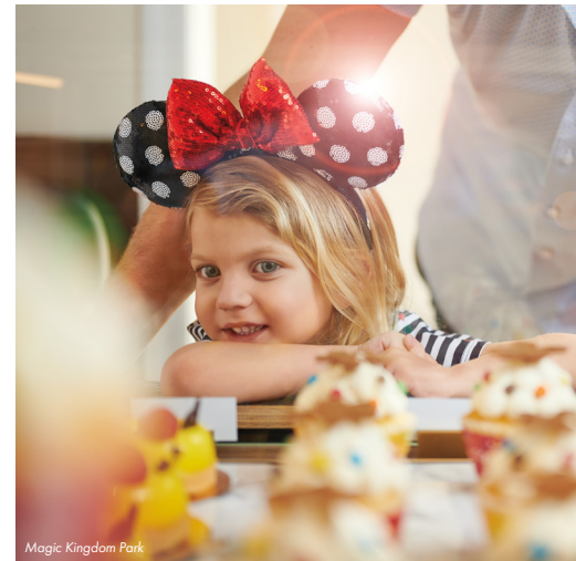
Magic Kingdom Park